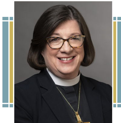
Presiding Bishop Elizabeth Eaton Evangelical Lutheran Church in America

Heal us, O Lord, so that we might be your healing presence now and always. Amen.